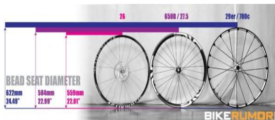
Fig: Wheel - structure

In our model tricycle we use three wheels have the dimension of Wheel Diameter 24"x 1 1/2" Tyre and Tube . This is used for the movement of the vehicle. Here one front wheel and two rear wheels are used. The distance between the rear wheels approx. 622mm.