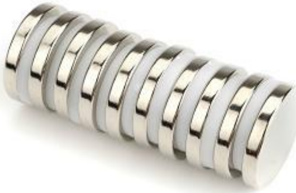
Fig neodymium magnets